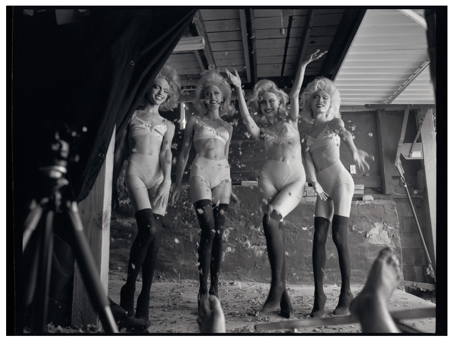
Ethyl Eichelberger Angels 2, 2019 Archival pigment print on rag baryta paper, mounted, framed with museum glass Available in three sizes, all within the same edition of 5 plus 1 AP

Instead, what Bailey-Gates invites us to do through A Glint in the Kindling is look without reaching for the terms we know. They invite us to simply look, unfettered by expectations or tradition. They invite us to look at bodies that joyfully drift between definitions, that find agency and poise where others find ambiguity and that are attuned to each individual and each moment. Objects, postures, relationships, clothes and actions we have been told are exclusive to a few are here reclaimed by anyone.