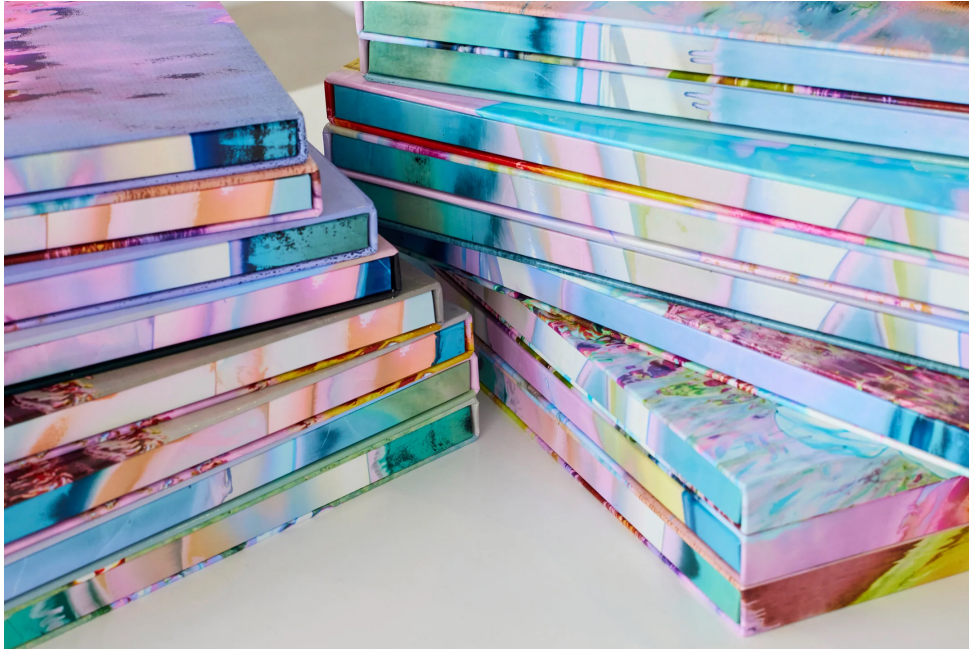
Jean-Vincent Simonet / Waterworks , 2021 Edition of 30 unique copies, all hand printed / only a few copies left Signed and numbered

Where Simonet's Mechanical Paintings are overwhelmingly abstract, works from his adjacent Heirlooms series have documentary origins, with a characteristic visual twist. Focusing on the material and architectural details of the factory – storage cupboards, paper waste bins, boxes of printed matter, the desks where design choices are made – they sidestep portrayals of the workforce, offering an alternative view on the business's conventional function. Printed on plastic, Simonet alters the resultant images with his fingertips, grappling physically with his own relationship to the site, from its systems of economic value to the burdens of its familial significance. By way of his interventions, each piece is made unique – a counterproposal to the uniformity of the commercial production line, and to the apparent reproducibility of photography.