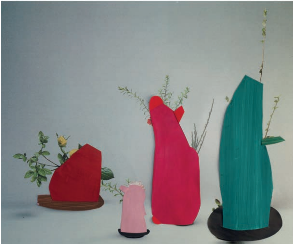
LEFT: Ruth van Beek - Untitled (Mask), 2016 Collage with photo and painted paper