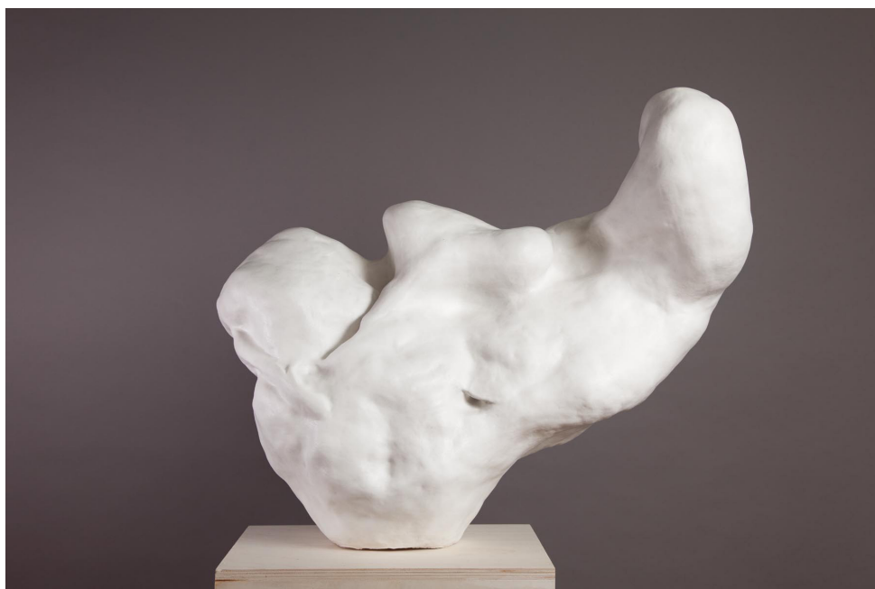
Mariken Wessels / The Chosen One , 2022 Glazed ceramics sculpture, wooden pedestal Size 75 x 95 x 50 cm / Unique piece