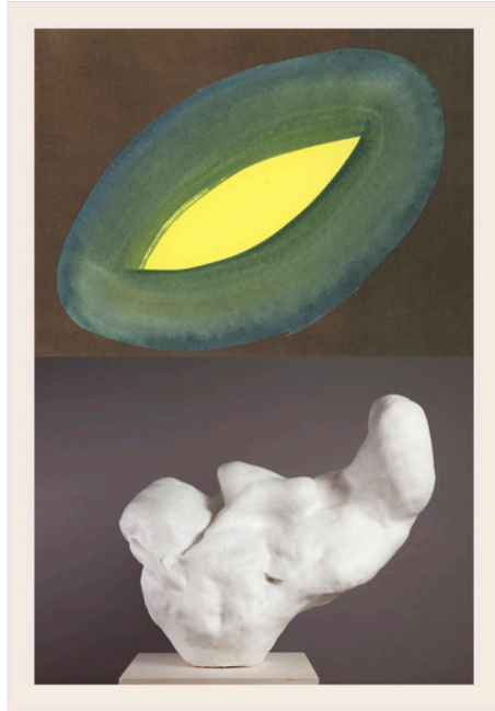
Cover 'Fruits of Labor', 2023